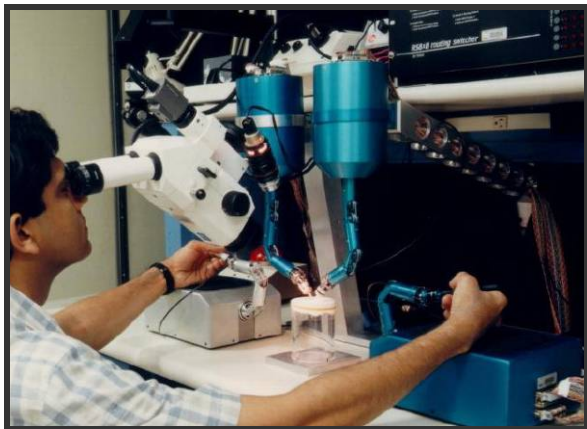
Figure 2. The RAMS microsurgical arms at JPL

NASA was the very first to invest into this field, the Jet Propulsion Laboratory and the MicroDexterity Systems Inc. developed the RAMS (Robot-Assisted Micro-Surgery) in 1994–1997 [8]. The RAMS consists of two 6DOF arms, equipped with 6DOF tip-force sensors, providing haptic feedback to the operator (Figure 2.). The robot was originally aimed for ophthalmic procedures, especially for laser retina surgery. It is capable of 1:100 scale down (achieving 10 micron accuracy), tremor filtering (8–14 Hz) and eye tracking.