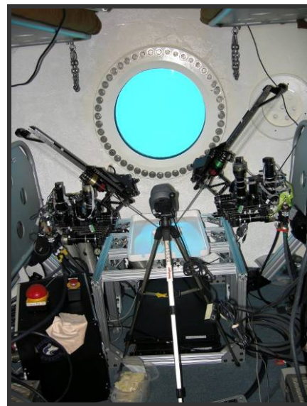
Figure 3. The Raven robot in a telemanipulation test

(DARPA) Defense Sciences Office funded the research to acquire a light-weight and dexterous system for the TraumaPod project that shall realize battlefield surgical robotic support for U.S. soldiers by 2010. The Raven has two articulated arms, each holding a stainless steel shaft for different surgical tools (Figure 3.). It can easily be assembled even by non-engineers, controlled by two commercially available Phantom 6DOF haptic interfaces, and its communication links have been designed for long distance remote-control. Besides the possibility of haptic feedback, additional sensors are mounted on the robot to provide more information to the surgeon and to avoid any critical failure due to communication delay.