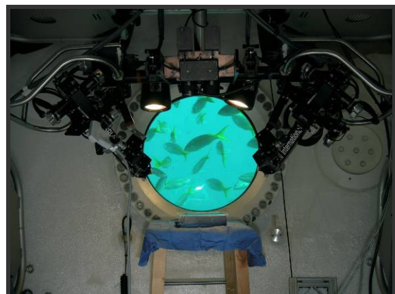
Figure 4. The M7 light-weight surgical robot on board of Aquarius sea habitat

The 7 th NEEMO project took place in October 2004, and the mission objectives included a series of simulated medical procedures with Zeus, using teleoperation and telementoring [15]. The four crew members (one with surgical experience, one physician without significant experience and two aquanauts without any medical background) had to perform five test conditions: ultrasonic examination of abdominal organs and structures, ultrasonic-guided abscess drainage, repair of vascular injury, cystoscopy, renal stone removal and laparoscopic cholecystectomy. The Zeus robot was controlled from the CMAS, Ontario, 2500 km away. The signal delay was tuned between 100 ms and 2 s to observe the effect of latency. The results showed that the non-trained crew members were also able to perform satisfyingly by exactly following the guidance of the skilled telementor.