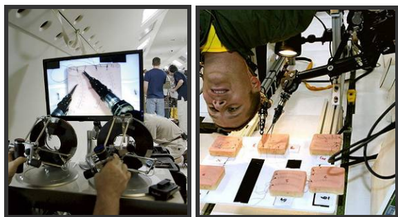
Figure 5. Zero-Gravity suturing with an M7 robot

The world's first operation in weightlessness was performed in 2003 on a rat on board of ESA's Zero-G plane (a modified Airbus A-300). In 2006, surgeons removed a cyst from a patient arm, while the Zero-G aircraft was performing 25 parabola curves, providing 20–25 s of weightlessness every time [17]. ESA plans to perform teleoperation in 2008 with a robot—controlled through satellite connection.